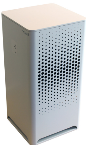
CAMCLEANER CITY M

To find out how to remove harmful particles and dust from precision production and manufacturing environments or to discuss your project requirements, email uk.filtersales@camfil.com or call 01706 238000